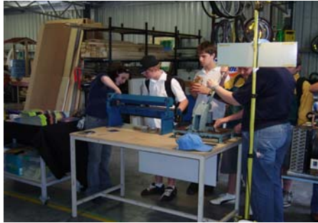
Students Participating in Try A Trade

Try A Trade is a very hands on experience for the students participating, they have the opportunity to try their hand at basic trade skills ranging from Hairdressing and Veteri-