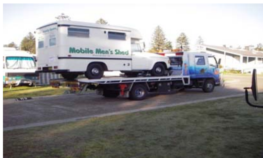
The Mobile Men's Shed being famously towed away for repairs

The Mobile Men's Shed (MMS) is an outreach service of the Men & Family Centre. It is based around a converted 1974 Dodge, ex Victorian ambulance, that has been designed to carry "tools" to assist men to build the life they desire.